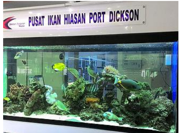
Port Dickson Aquarium

1.00pm Halal Lunch will be served at City Park Oriental Seremban 2 restaurant.