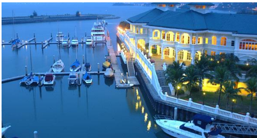
Avillion Admiral Cove